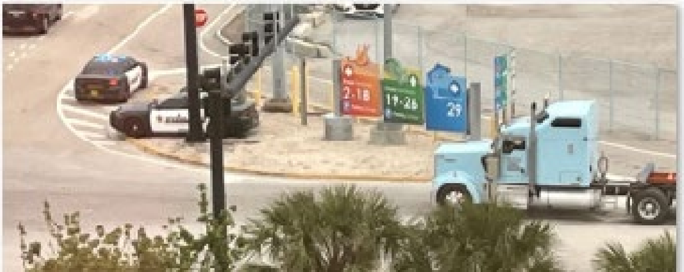
Site for artwork